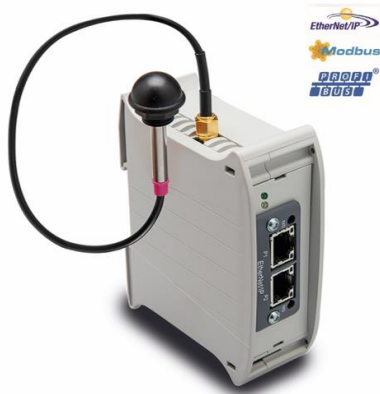
UC-RF control unit

Small production batches and different formats are setting a new trend among packaging, food, and pharmaceutical sectors. Plant and equipment require components able to offer high flexibility production issues.