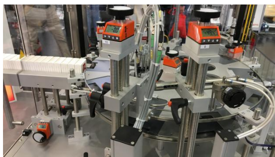
Elesa+Ganter DD52R-E-RF electronic position indicators application on a JW Verpackungstechnik packaging machine

Moreover, the wireless system doesn't need the supply cable installation and the data swap between indicators and the control unit. Therefore, time and errors sometimes generated by a difficult and expensive installation are reduced to the minimum.